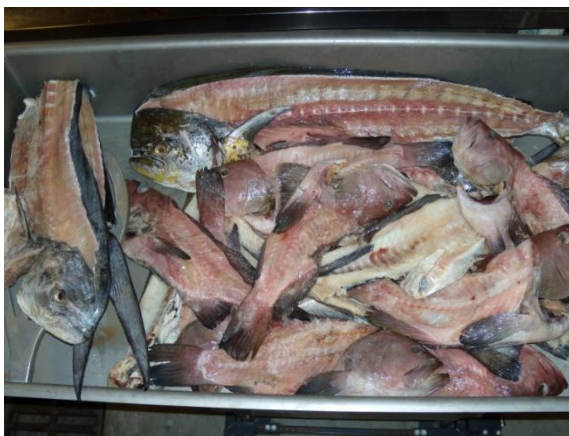
Figure 2. Assortment of trimmings from a local processor.

A total of approximately 2.5K metric tons (MT) of bony fish was landed in southern California in 2011, excluding sardines (17.6K MT), anchovies (0.8K MT) and mackerel (1.3K MT). Of this total, the top 12 contributors accounted for 95% of the landed biomass (Table 1).