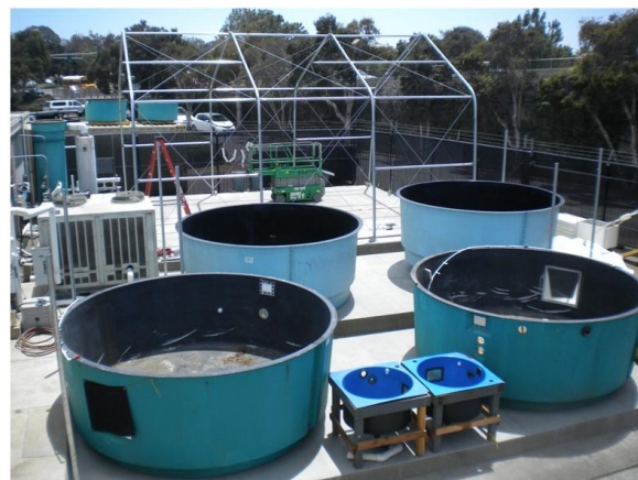
Figure 1. Construction of new broodstock nutrition research area.

As part of this project we will explore how various supplements in broodstock diets can affect egg quality and early larval survival, toward the goal of optimizing broodstock diets. To accomplish this, adult YT will be partitioned into four pools of 12m 3 each allowing for two treatments with two replicates. The new broodstock maturation systems are currently under construction and slated to be completed this summer so they can be stocked with fish. Initially we will compare broodstock diets supplemented with arachidonic acid against diets that are not supplemented.